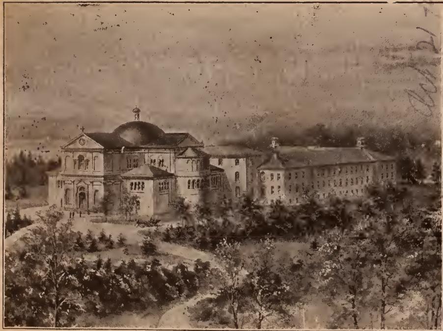
MOUNT ST. SEPULCHRE, WASHINGTON, D. C.